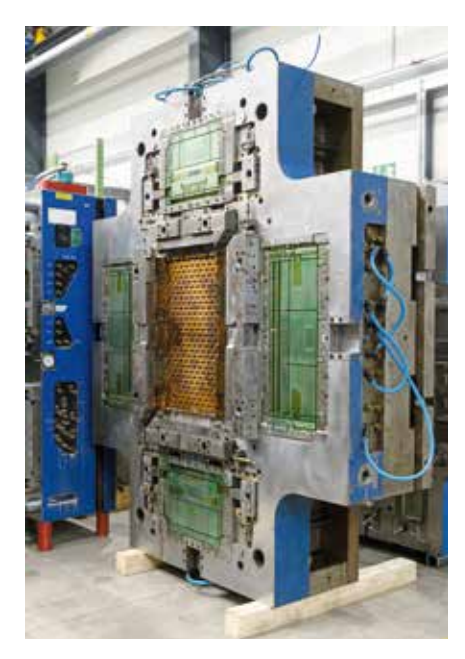
A typical injection mould for five of the eight elements of a folding box.

circuits, the new Engel-duo machines monitor the process with help of cavity pressure and numerous machine parameters, optimise the consistency of the moulded part weight with the help of the "iQ weight control" software and are capable of communication through interfaces for MES systems via OPC/UA (Euromap-77).