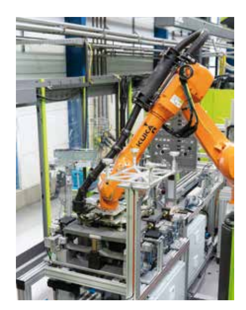
In the fully automatic pallet assembly, the robot presses the deck onto the three runners.

provide slip resistance for the forks of lift trucks, and various openings in the deck allow for easy manual handling. The main requirements for a skid pallet are high rigidity, so that it deflects as little as possible, if at all, but also high impact strength, so that it can withstand fork impact and guarantee moving in the roller bearings at all times. Walther has used simulations, filling studies and test series to determine which formulation with short and long glass fibres is necessary, how they must be distributed and aligned in the polypropylene and how a rheologically optimised moulded part filling might look like.