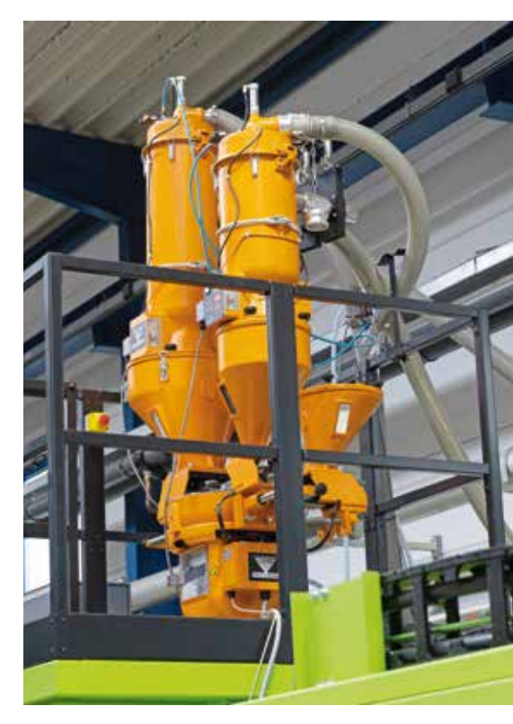
For the new pallet, as on all the machines, gravimetric metering of virgin material, recyclate and masterbatch ensures the exact composition of the injection moulding compound.

Walther has now equipped five moulds with this system. "In recent years, we have not been able to expand our own production at Formex as quickly as our order volume has increased. That's why we have also outsourced individual moulds to partners. With Mould Monitoring, we monitor the condition and parameters regardless of whether the mould is operating in our own production or at a partner company. This gives us very valuable information." ■